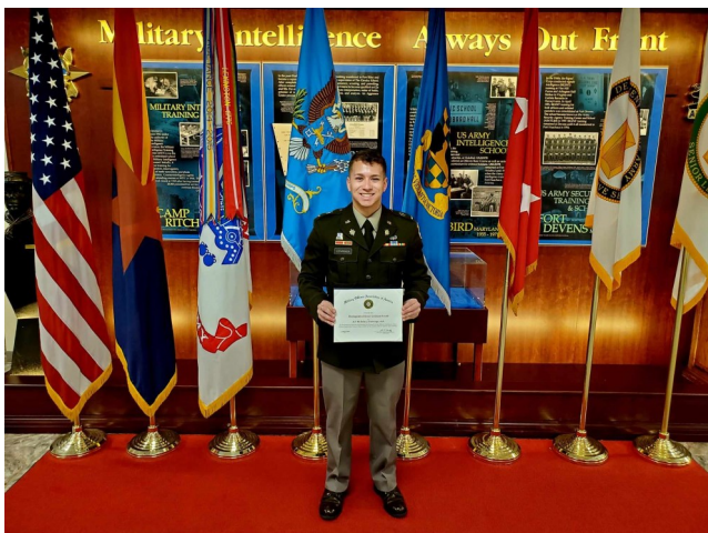
Distinguished Honor Graduate BOLC Class 24-001, 12 March 24