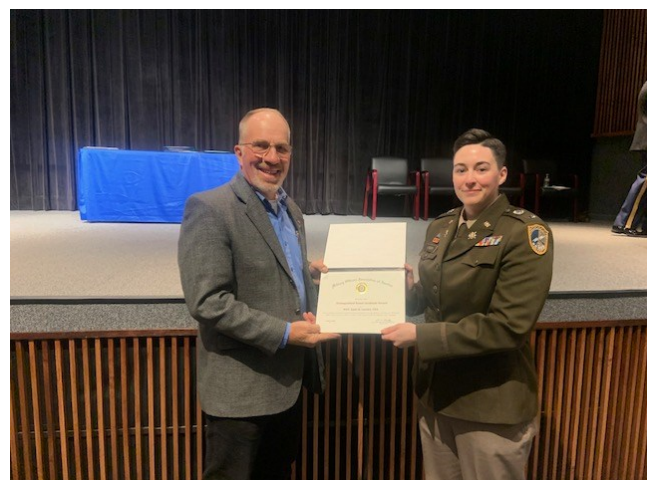
Distinguished Honor Graduate WOBC Class 24-001, 15 March 24